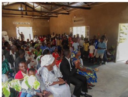
The Christian Mercy church service

The Lord God has saved many souls through the Christian Mercy church. So many people joined us and after becoming a big number, we formed a church. The Christian Mercy church is the fast growing church in this area and she is now among the biggest churches in Gastibo district.