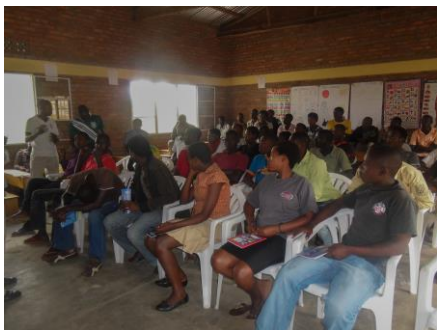
The CMM youth empowerment club

CMM youth empowerment club training held in Ntende village. This has made the youth more competent, they are now aware of their rights most of them are now able to claim their rights. Our youth became more aware of their responsibility in reaching their destiny