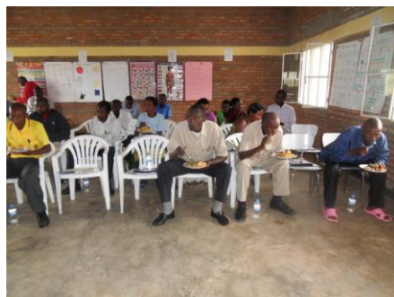
Teachers from Rugarama primary school and local leaders from Ntende village in training.

Most of time I would spend time at home or just at the village centre but ever since I joined this club my life is a changed chapter of what it used to be. I gained some competence and I can think and prepare of my future I thank God for CMM to be in this village .