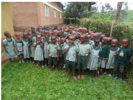
Pre-school's children in Ntende

Here are the Pre-school's children in Ntende village, some of kids are graduating to primary one, but still is a challenge of long distance to school, children used to take a short cut , but now is blocked by water floods. The whole valley turned to a lake